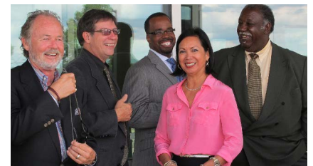
Board Of Trustees