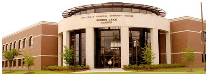
Spring Lake Campus